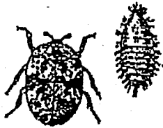
Varied Carpet Beetle Adult (L), Larva (R)

Carpet beetles are destructive insects that may be found in the home. Common species are the black carpet beetle ( atragenus megatoma ), the varied carpet beetle ( anthrenus verbasci ), the common carpet beetle ( anthrenus scrophulariae ), and the furniture carpet beetle ( anthrenus flavipes Le Conte). These insects vary slightly in size and coloration, but generally are similar and difficult to tell apart. Adult black carpet beetles, largest of these beetles, are oval and shiny black, similar to a ladybug, with brownish legs. They vary in body length from 1/8-3/16 inch. Larvae are golden to dark brown and about 1/4-1/2 inch long with the body resembling an elongated carrot or cigar. A long brush of bristles is at the tail end of the larvae.